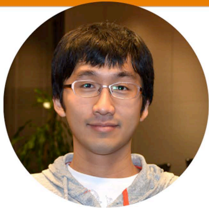
Mentored by the Image Spatial Data Analysis group